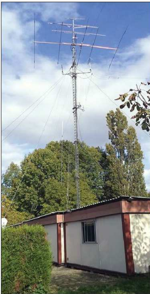
The Radio Club du REF67 clubhouse.

All in all, it was a unique experience and unlike any other VE session I've ever participated in. It illustrated the true international nature of ham radio and how our hobby brings together people of different cultures so we can become better acquainted with each other. Our grateful thanks to everyone at REF67/F6KQV for their generous hospitality, and we look forward to future such events with great anticipation!